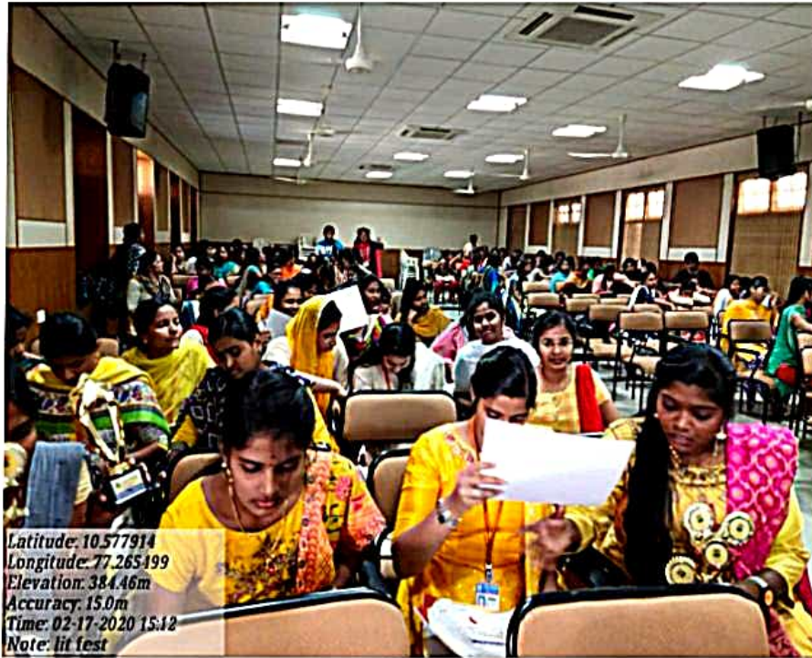
Latitude: 10.577914 Longitude: 77.265499 Elevation: 384.46m Accuracy: 15.0m Time: 02-17-2020 15:12 Note: lit fest